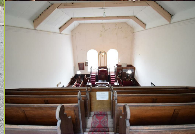
Watford Chapel , Caerphilly, CF83 1LP £160,000